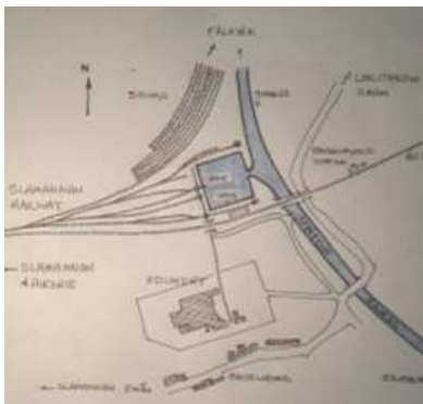
Old railways at Causewayend basin

Consult the separate guide "By canal betwixt Linlithgow and the Falkirk Wheel" for a detailed guide to the route for which key features are shown below.