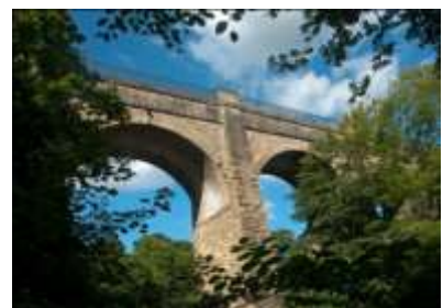
Avon Aqueduct from above and below